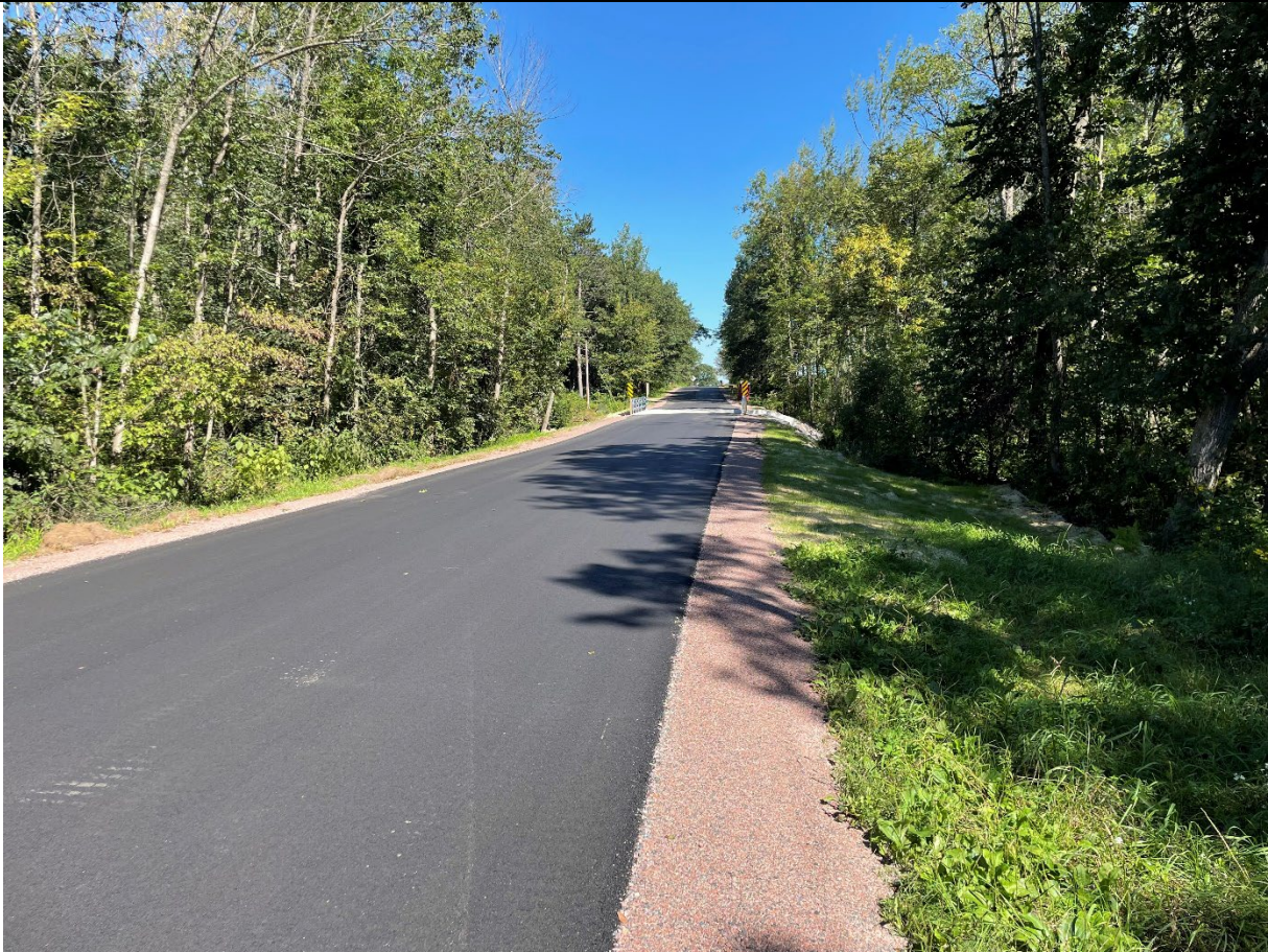
100 th Street Roadway – Looking North