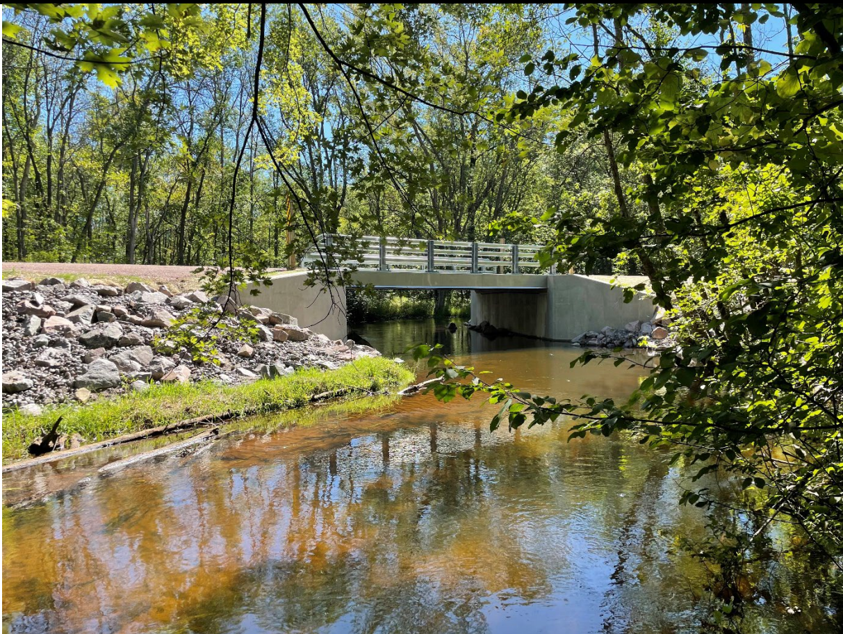
100 th Street Bridge – Looking Upstream