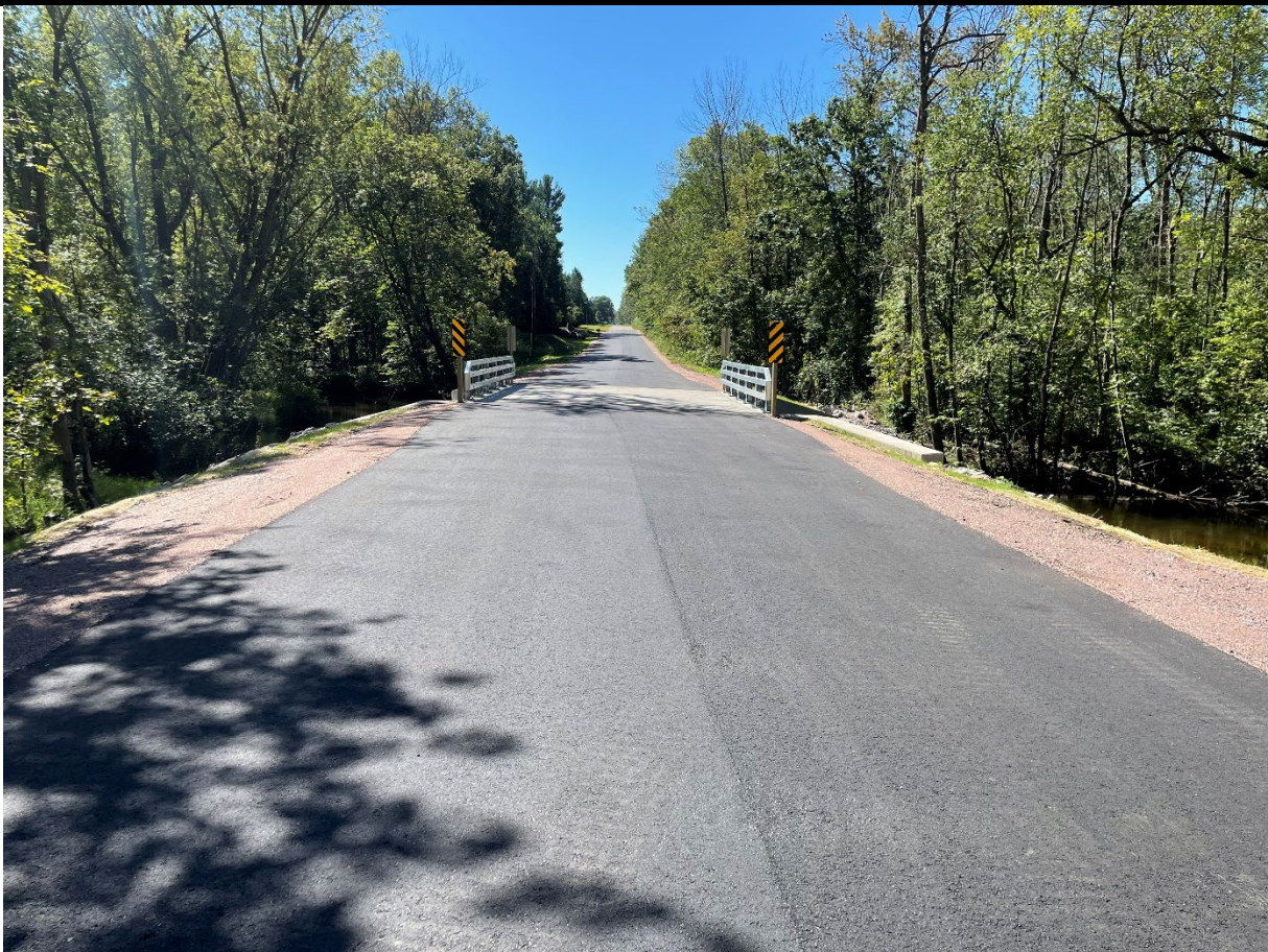
100 th Street Roadway – Looking South