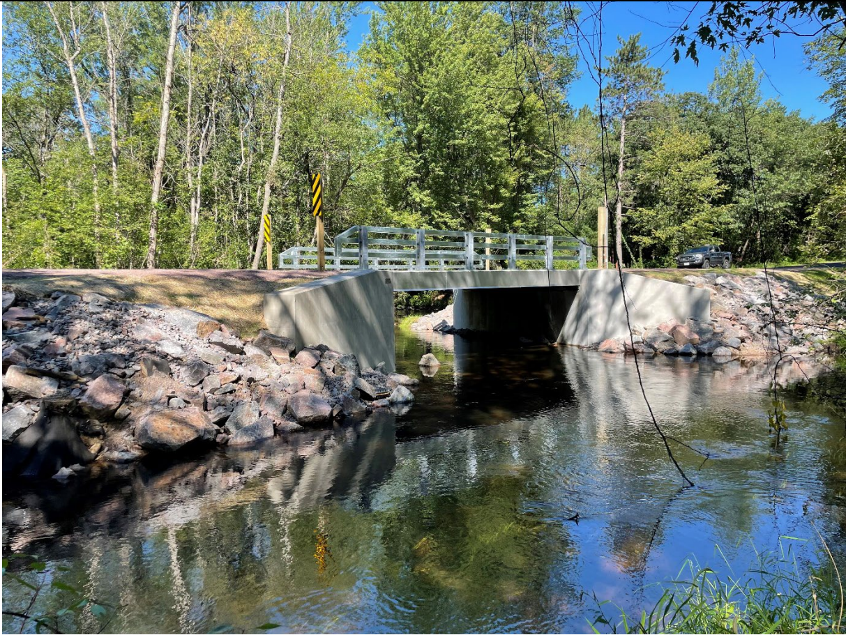
100 th Street Bridge – Looking Downstream