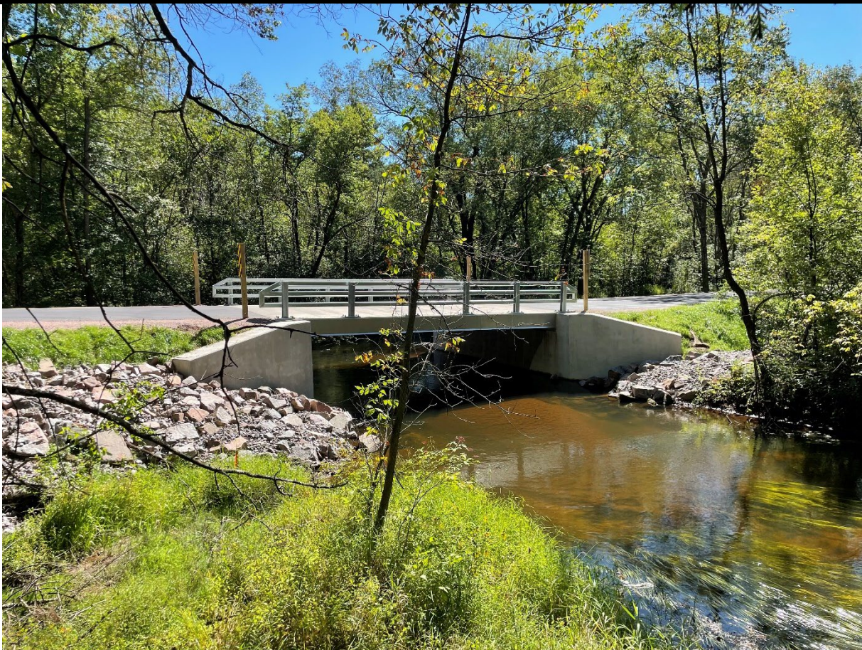
95 th Street Bridge – Looking Upstream