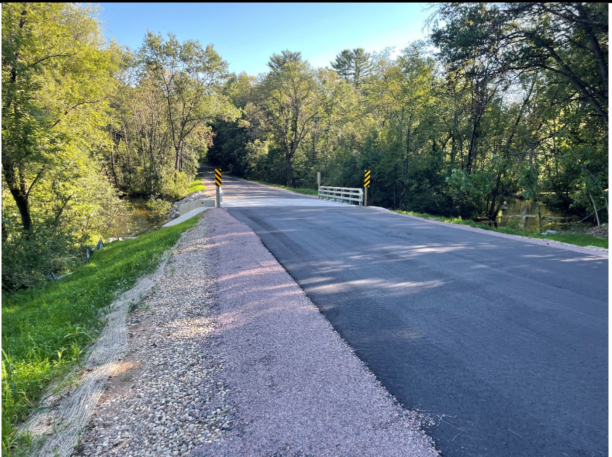
95 th Street Roadway – Looking South