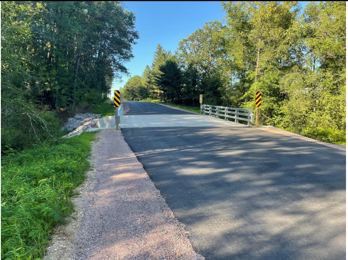
95 th Street Roadway – Looking North