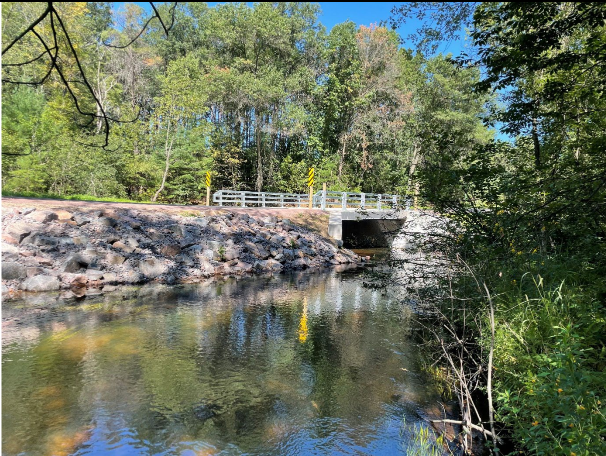
95 th Street Bridge – Looking Downstream